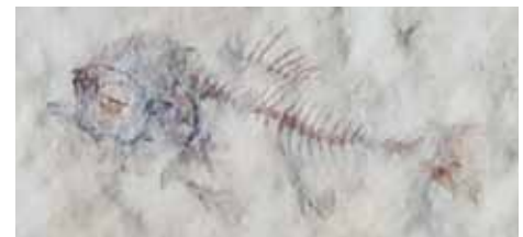
Baby Priscacara from Kemmerer