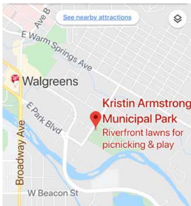
Map to Picnic Location Kristen Armstrong Municipal Park 500 S. Walnut St., Boise Tuesday, July 16, 2024 6:00 p.m.

After the meeting, the program will be an Auction to help offset costs for our annual Banquet in January. Bring whatever you would like to donate and be ready to look for new pieces for your collection. Come join us for a fun evening. Hope to see you all there!