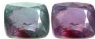
Step cut Alexandrite by Alexandrite.net contributors Photographed by David Weinberg for Alexandrite.net

The colors are bluish green in daylight and purplish red in incandescent light. The optic character is referred to as doubly refractive. The color-change transformation can be so striking that it is often called “the Alexandrite effect.” While a few other gem minerals like corundum, garnet and spinel can also exhibit color change, none radiate such vivid and profound color change as an alexandrite. The most coveted stones transform from a lush green or bluish green in daylight or fluorescent light to bright red or purplish red under candlelight or incandescent light.