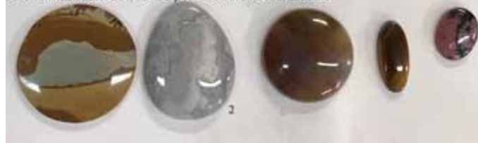
Sample cabs made for judging in the R.O.L.E. program.

Each stone must earn at least 85 points on the R.O.L.E. scale.