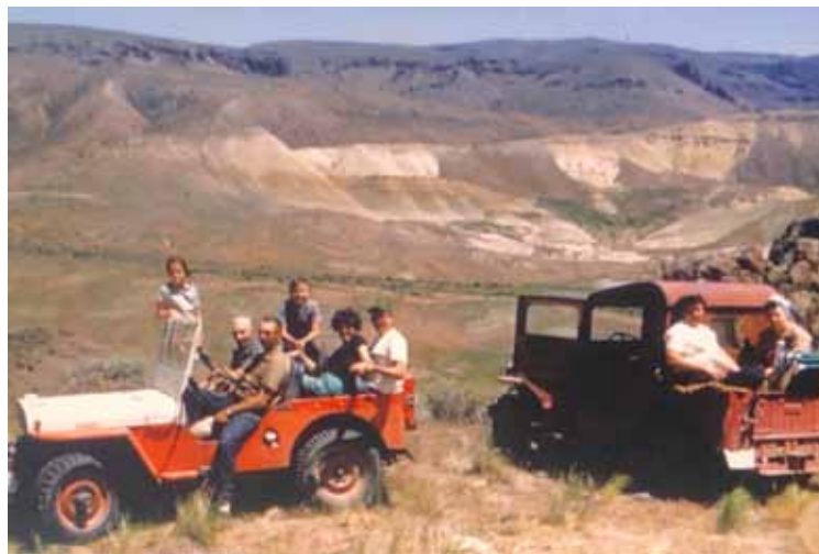
Moore Family field trip, circa 1960s