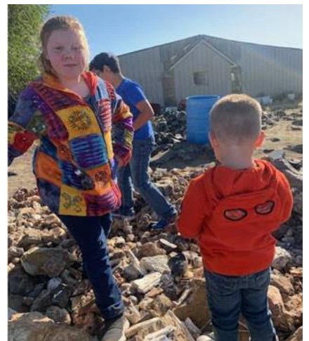
Displaying the importance of colorful clothing while on a field trip.