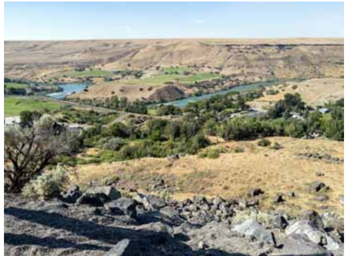
Hagerman Fossil Beds