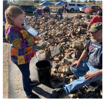
Displaying the importance of staying hydrated.

Other suggestions made to the juniors and their parents is to watch a couple of the Outdoor Idaho shows about rock hunting in Idaho and Oregon (some are available for check-out in our library). The Idaho Gem Club was recorded in one episode of this television program several years ago. The juniors were given a copy of the Field Trip curriculum to use as a reference for their future travels.