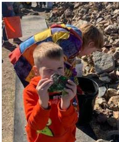
Look what I found!

We went through the Field Trip Badge curriculum explaining the Code of Ethics and how important it is to always follow these very important rules. When planning for field trips, it is always important to