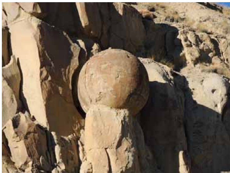
Stone concretions, Utah