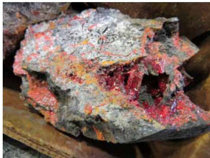
Realgar Crystals, Nevada