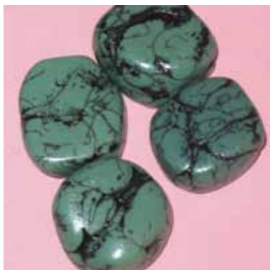
Handmade polymer clay turquoise

rather than a synthetic). Gilson turquoise is made in both a uniform colour and with black “spiderweb matrix” veining not unlike the natural Nevada material.