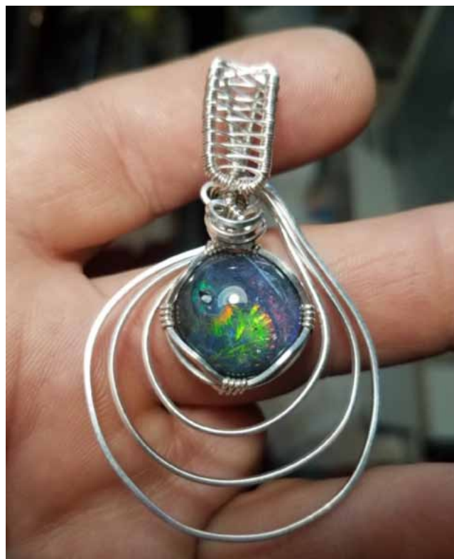
Rick Corbett Wire Wrapped Opal

These fakes are detected by gemologists using a number of tests, relying primarily on non-destructive, close examination of surface