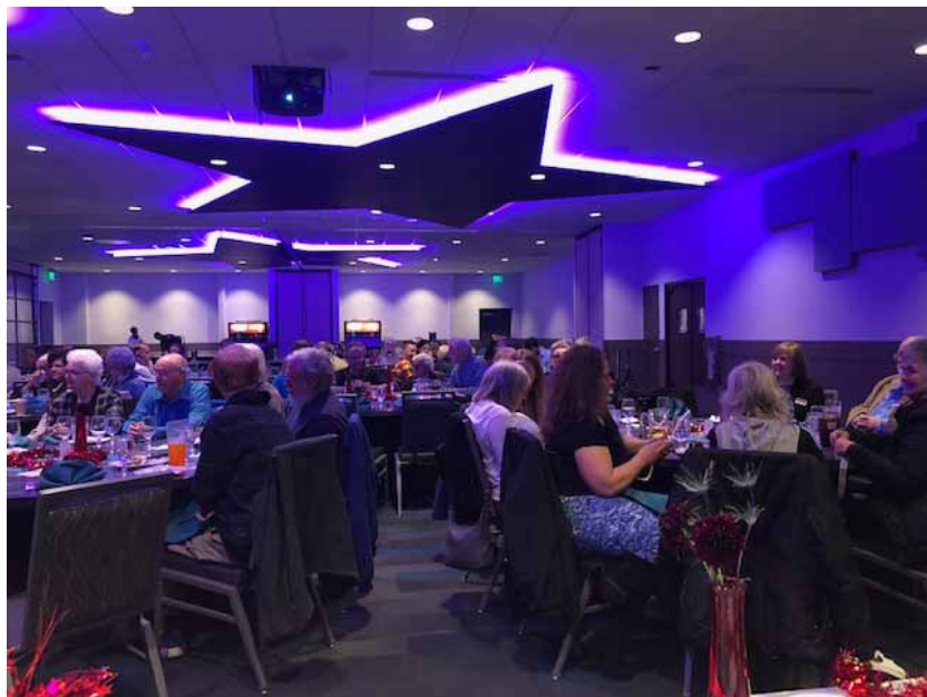
The Galaxy Event Center