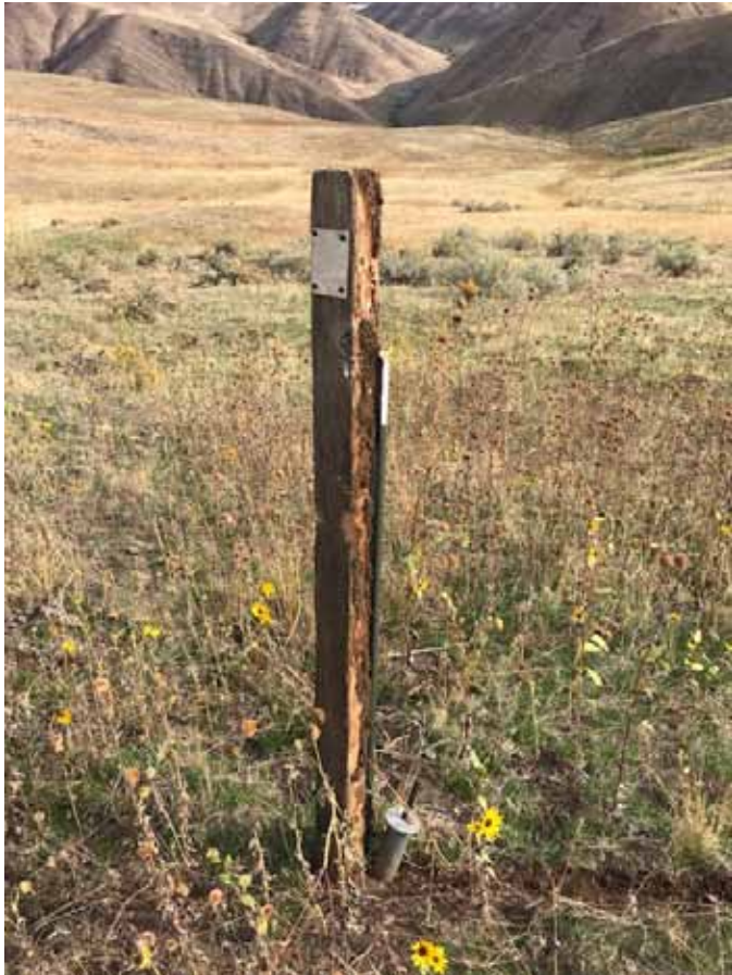
(Beacon Hill, Washington County, Idaho)

day field trip to Beacon Hill for geodes on September 28th and 29th. Doug reported all the posts were up but we should probably replace a couple of them next summer and give them a fresh coat of paint. As you can see from the below picture they are in need of a fresh coat of paint.