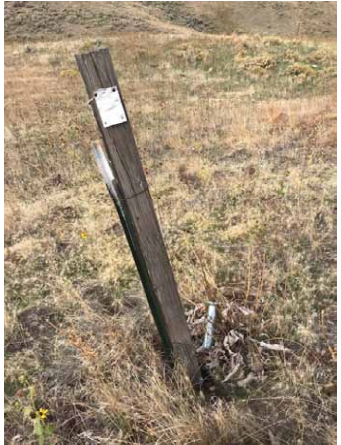
(Beacon Hill, Washington County, Idaho)

Etiquette while digging in club pits should always be honored. When club members are digging, if a person leaves their tools in the pit to mark the spot where they are digging while they stop for lunch or just to take a break, their tools reserve their spot in the pit. Please do not push aside someone's tools and dig where they have left their tools.