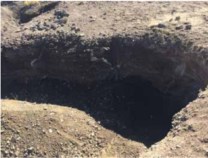
(pit on the sunstone claim where over hang is no longer)

There had been some concern about an over hang from members digging in the side of the wall in the club pit out on the sunstone claim. Cheryl took a sledge hammer and bucket and pounded on the over-hang for over an hour until all the over burden had been removed. It is highly suggested that as you dig in our club pits you do so with the safety of yourself and others always in mind. Please do not leave any over hang on the tops of any club pits that could fall on someone and hurt them. The same could be said that should someone be walking on the top along the edge of the club pit and in theory the over-hang could give way potentially and could hurt someone. Please leave a safe environment for people.