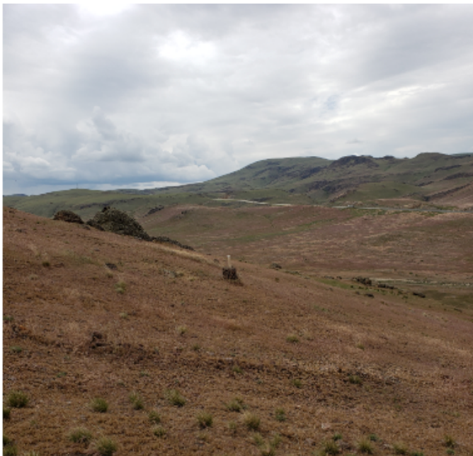
(Elephant Butte, Owyhee County, Idaho)