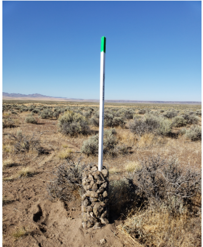
(Plush, Lake County, Oregon)

In early September five club members volunteered to drive to Plush, Oregon, to check on the mining claim post markers for the three Faceteer sunstone claims. All the claim posts were up and intact. It had been several years since we painted the posts, so Tom Rogers decided to take the fluorescent green paint for the caps of the posts while Doug Renken and Cheryl Link headed out to paint the posts white. All of the posts have a fresh coat of paint to preserve the wood markers. We placed a wire cage around the two top markers and loaded rock in the wire cage to help prevent vandalism and help prevent the post from burning in a wild brush fire. I would like to personally thank Tom and Lillie Rogers and Doug and Willa Renken for willingly driving the 7 plus hours one way to help maintain the club's claims. We even witnessed a large wild fire run the top of the Steen Mountains Sunday night.