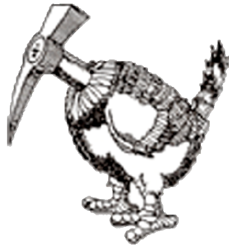
The Whangdoodle Bird (Often seen on field trips)